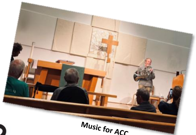
Music for ACC