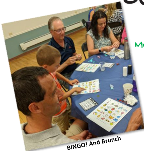
BINGO! And Brunch