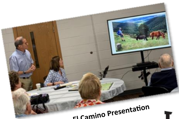
El Camino Presentation

It might be the “lazy, hazy” days of summer, but things are HOPPING at Epiphany! We hope you are all enjoying a bit of summer sabbath!