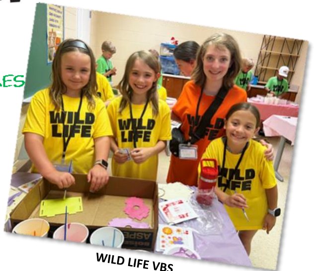
WILD LIFE VBS